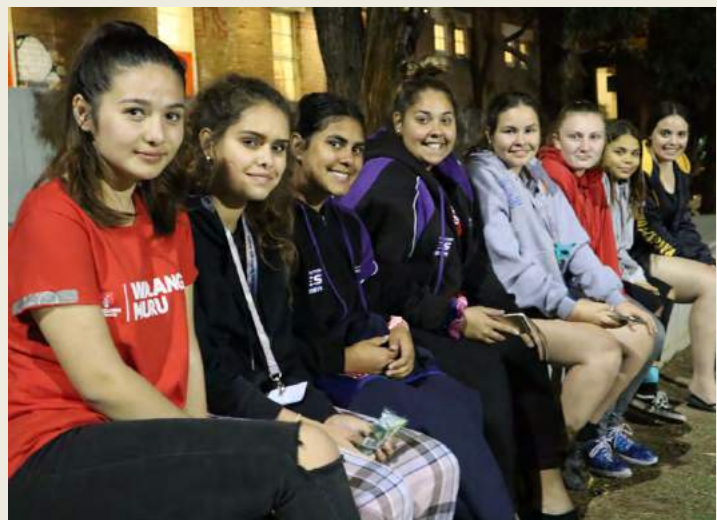
Please note the above activities are subject to change.